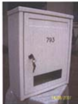
INDIVIDUAL UNIT TYPE: WP 350W x 400H x 110D