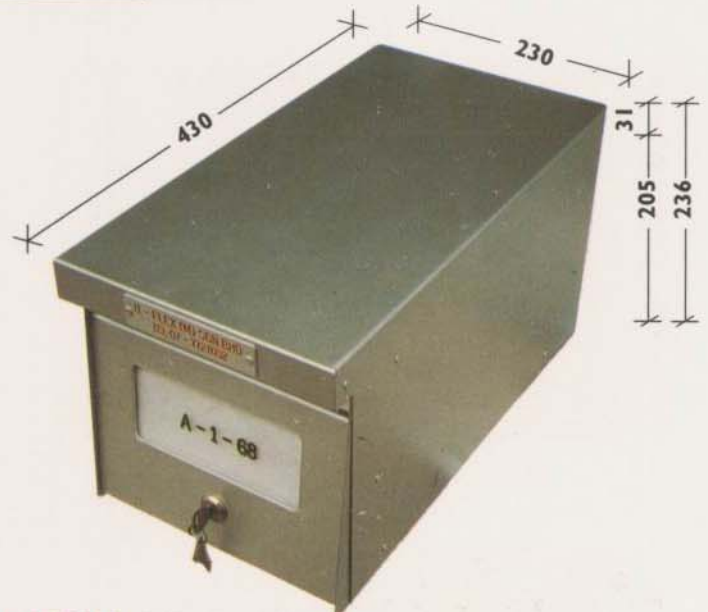
TYPE : MC 230 (W) x 236 (H) x 430 (D) DESIGN : TOP HUNG WITH WINDOW DISPLAY