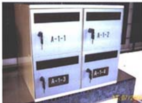
TYPE: 2 TONE SIDE HINGED (PLAIN DOOR/WINDOW DISPLAY)