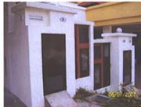
TYPE: GATE UTILITY CHAMBER FOR HOUSES