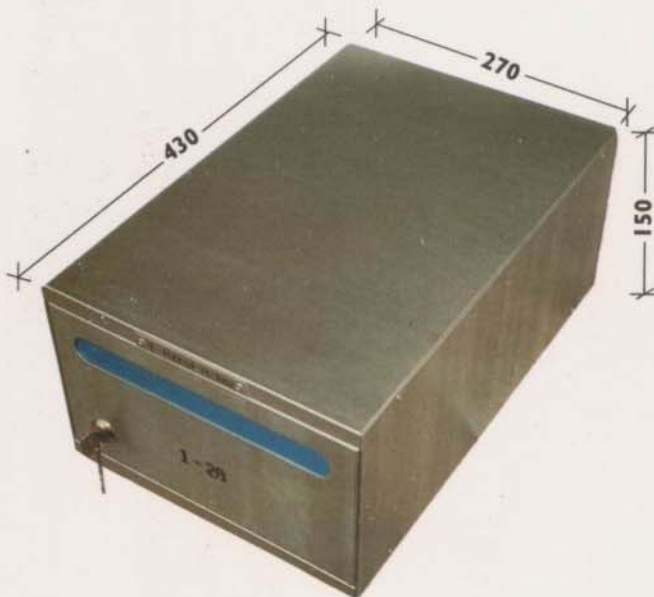
TYPE : ND 270 (W) x 150 (H) x 430 (D) DESIGN : SIDE HUNG PLAIN DOOR