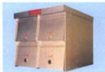
TYPE: LC 230W x 200H x 430D