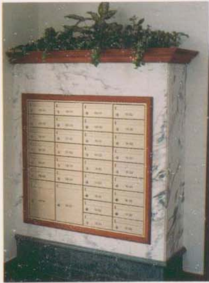
TYPE: ND 270W x 150H x 430D