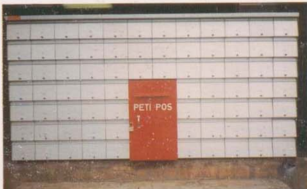
TYPE: MC 230W x 236H x 430D WITH POST BOX