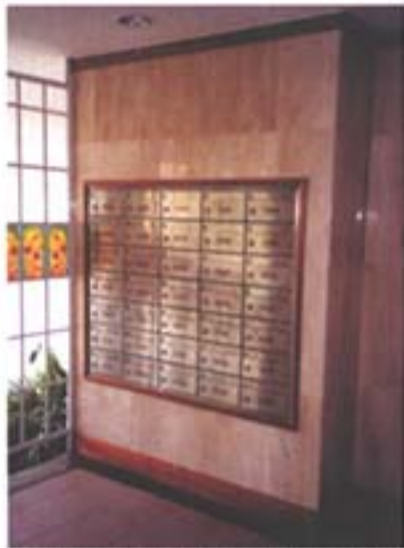
TYPE: ND 270W x 150H x 430D

DESIGN CONSULTATION • FACTORY COST PRICE • DELIVERY/INSTALLATION NATION WIDE