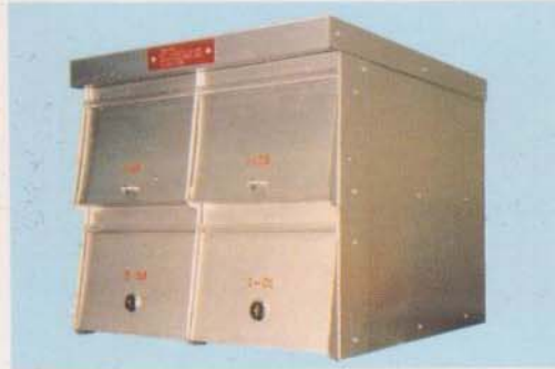
TYPE: LC 230W x 200H x 430D