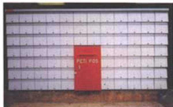
TYPE: LC 230W x 200H x 430D WITH POST BOX