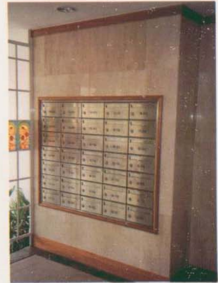
TYPE: ND 270W x 150H x 430D