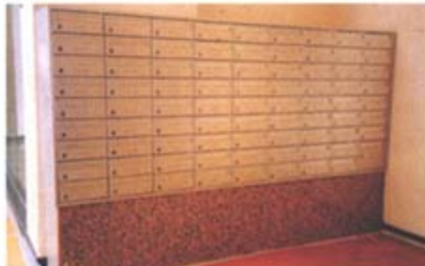
TYPE: ND 270W x 150H x 430D