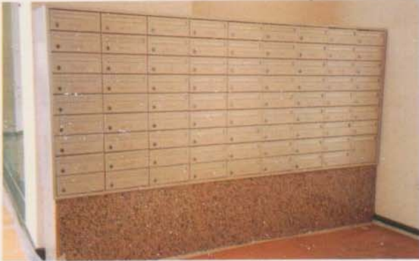
TYPE: ND 270W x 150H x 430D