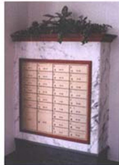
TYPE: ND 270W x 150H x 430D