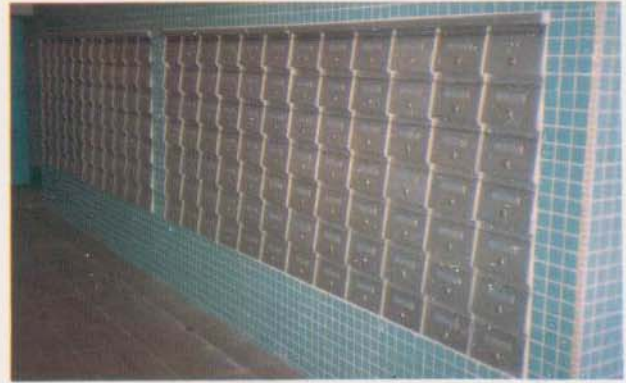
TYPE: LC 230Wx 200H x 430D