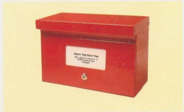
INDIVIDUAL UNIT TYPE : SU 350W x 236H x 170D