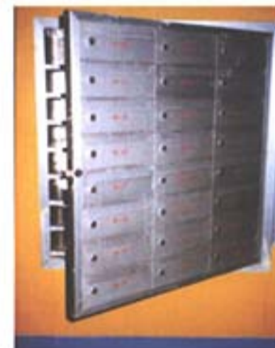
TYPE: MASTER DOOR