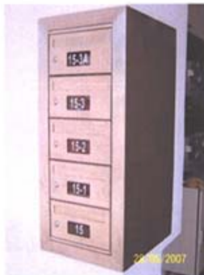
TYPE: ND+W 270W x 150H x 430D WITH WINDOW DISPLAY AND FRAME