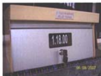
INDIVIDUAL UNIT TYPE: SU 350W x 200H x 200D