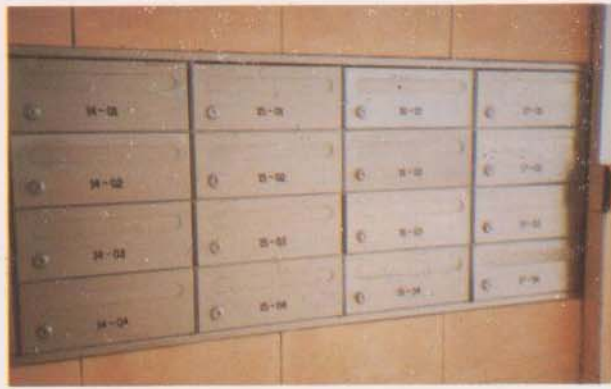
TYPE: ND 270W x 150H x 430D