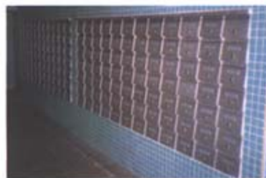
TYPE: LC 230W x 200H x 430D

ONE STOP COMPLETE MAIL BOXES (MAIL DELIVERY / COLLECTION SYSTEM).